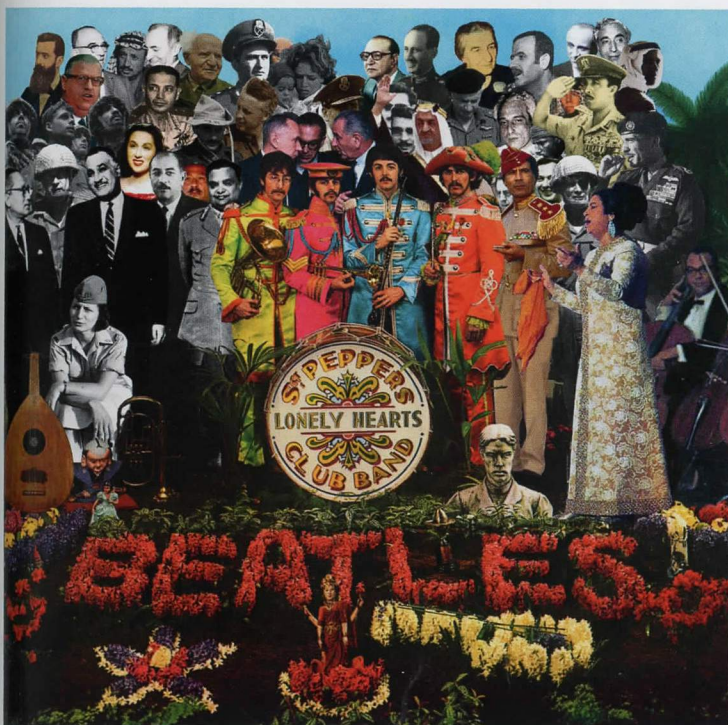
6. The Breakup , 2012, Michael Rakowitz, collage on found album sleeve of Sgt. Pepper's Lonely Hearts Club Band (1967), 30.5 x 30.5cm