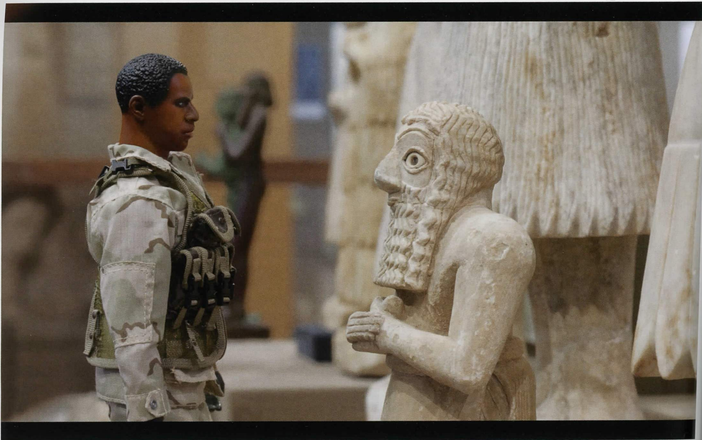
5. The Ballad of Special Ops Cody , 2017, Michael Rakowitz, stop-motion video, 14m,42s

theory and practice at Northwestern University near Chicago, where he lives with his family – and where he is when we speak.