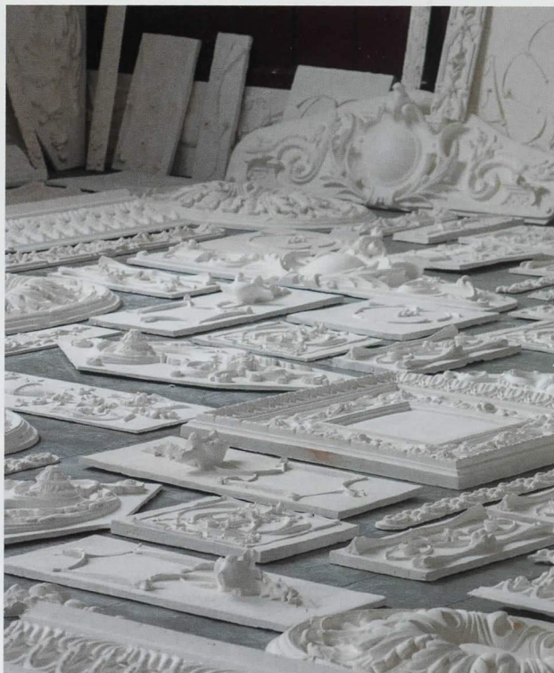
7. The flesh is yours, the bones are ours , 2015, Michael Rakowitz, plaster casts, rubbings, vitrines, bones, writing, ephemera, dimensions variable (installation view at the 14th Istanbul Biennial)