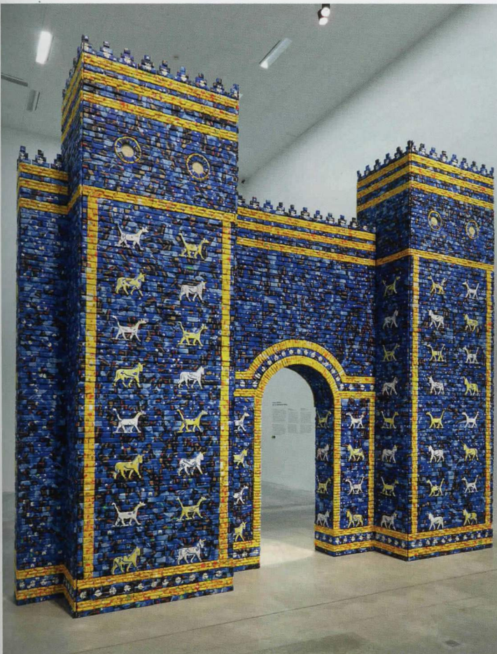
4. May the arrogant not prevail , 2010, Michael Rakowitz, Middle Eastern food packaging and newspapers, glue, and cardboard on wooden structures, 597.5 x 493.4 x 95.3cm. Museum of Contemporary Art Chicago

Sassoon: 'I believe that this war, upon which I entered as a war of defence and liberation, has now become a war of aggression and conquest.'