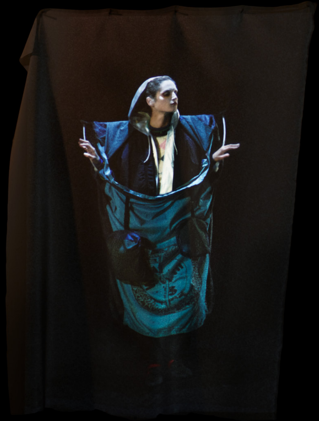
jacket MIU MIU