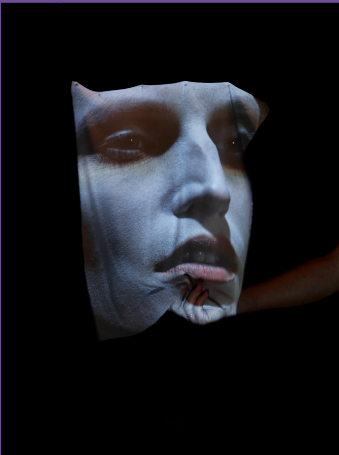
fashion TATI COTLIAR