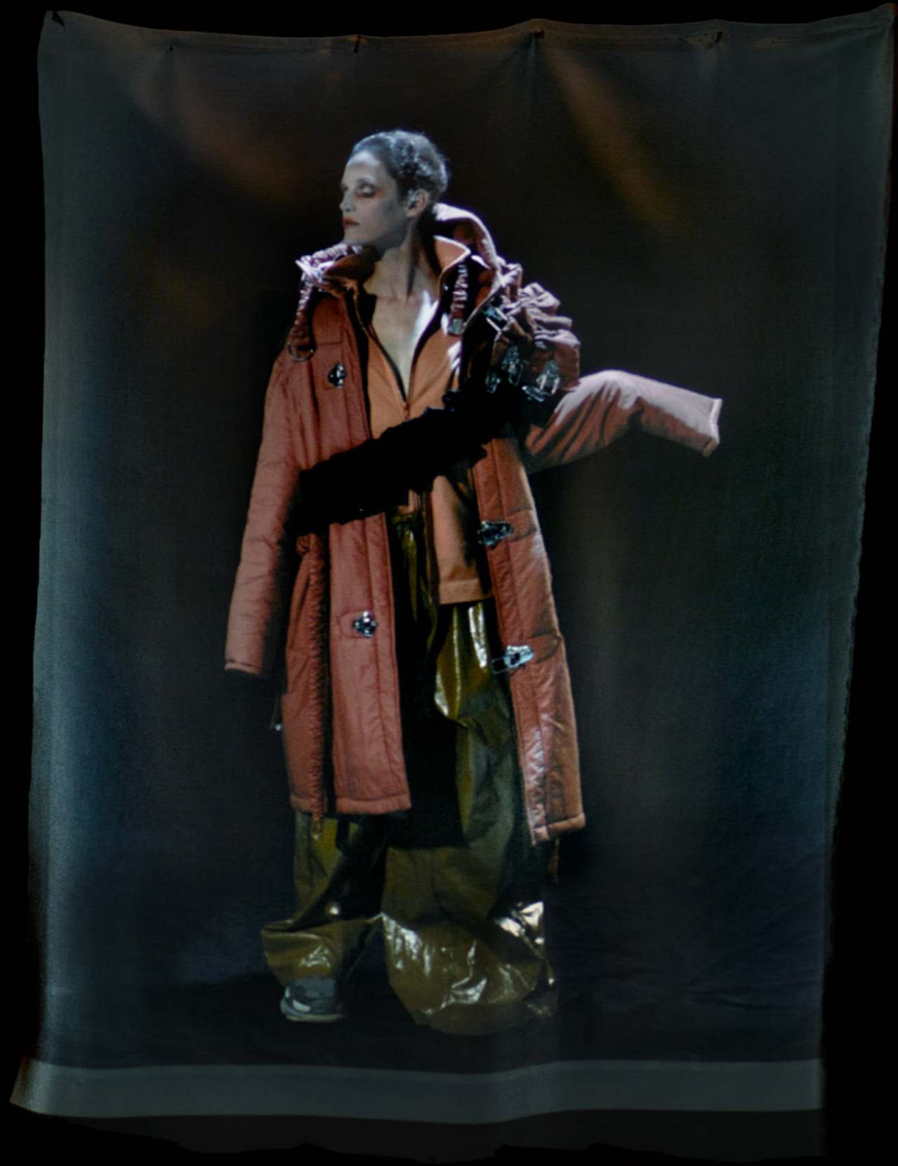
coat and sash both CRAIG GREEN