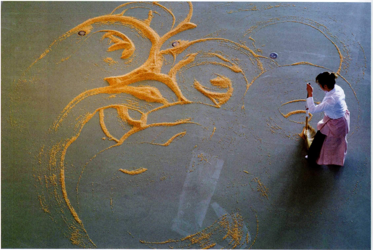
Performance view of Lee Mingwei, Our Labyrinth , 2015–, performance installation with rice, grains, seeds, costume, and dance.