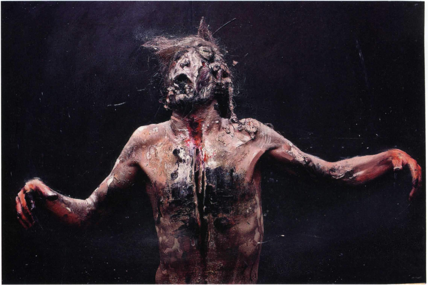
Olivier de Sagazan, Transfiguration (performance still), 2016, clay, paint, and hair residue.

moved the conversation in a very different direction from the commercially oriented ones between dealers and collectors. Curated by the Delhi-based Raqs Media Collective and titled “Why Not Ask Again? Arguments, Counter-arguments, and Stories,” the exhibition was ominous and chaotic, and debuted one day after Donald J. Trump’s unexpected election to the presidency of the United States.