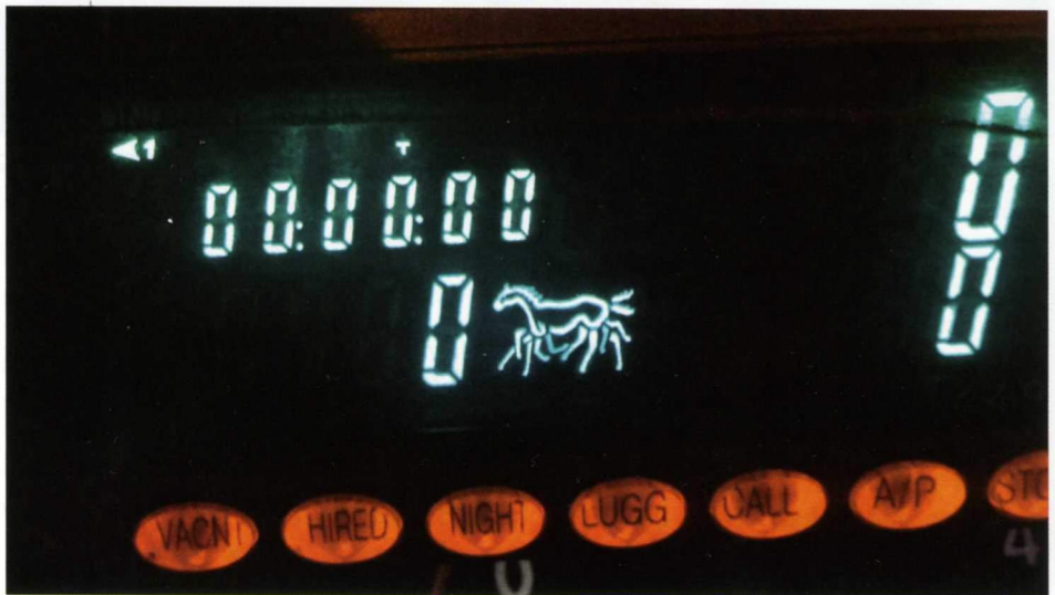
FROM TOP Performance view of Aki Sasamoto, Delicate Cycle , 2016, kinetic sculptures, washing machines, video, and performance. Rheim Alkadhi, Night Taxi , 2016, video and paper, infinite loop.

artist dresses as a young Muslim lady, describing herself in anthropological terms to an assembled audience. The Indian duo Desire Machine Collective’s video Noise Life (2008–14) employs ethnographic language to explore how we develop our self-image. Superflex’s humorous video Exchange of Pigs and Bits (2016), which