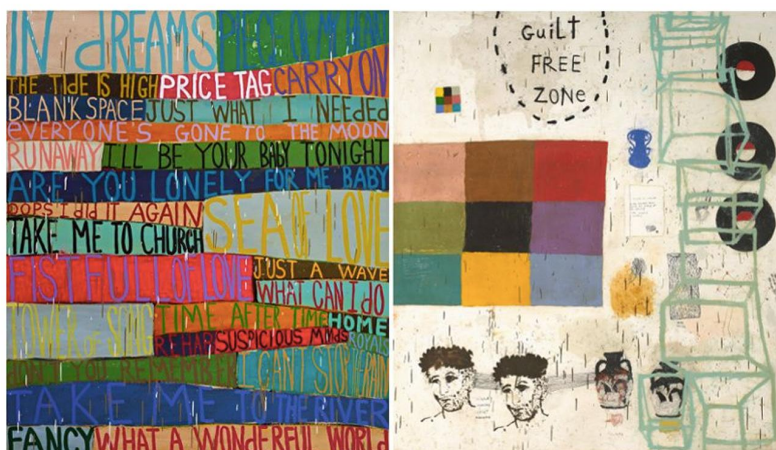
Left : Squeak Carnath – The Whole Truth, 2006 / Right : Squeak Carnath – Nearly Perfect, 2015